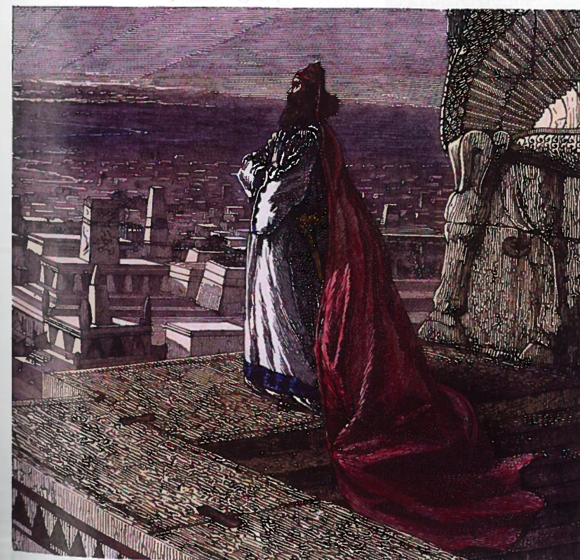
From his palace walls, a Sumerian king looks out over the city-state he rules.