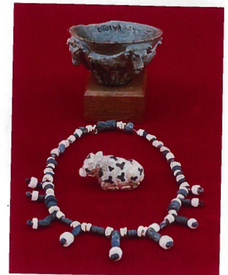
The Sumerian artifacts above include a necklace of lapis lazuli and marble pearls, a limestone figure of a cow, and a stone bowl with a bull carved in relief.

◀ The Standard of Ur depicts scenes of war and peace in ancient Sumer.