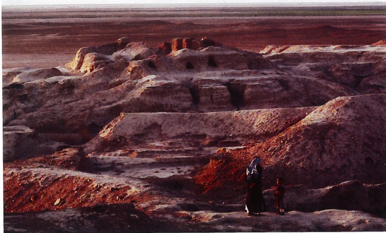
This man and child are standing in the ruins of the ancient city of Uruk, located in present-day Iraq.