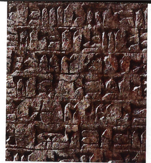
Shown here is cuneiform writing etched in a clay tablet.

Cuneiform was based on an earlier, simpler form of writing that used pictographs . Pictographs are symbols that stand for real objects, such as a snake or water. Scribes used a sharpened reed to draw the symbols on wet clay. When the clay dried, the marks became a permanent record.