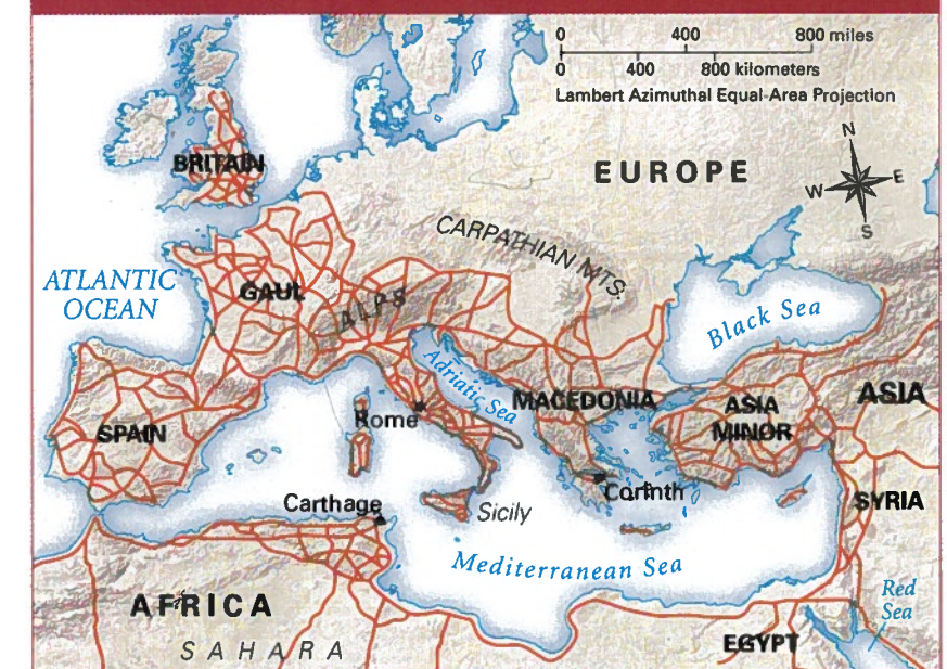
Roman Roads, About 100 C.E.

◀ The Forum was the center of the city and the empire of Rome.