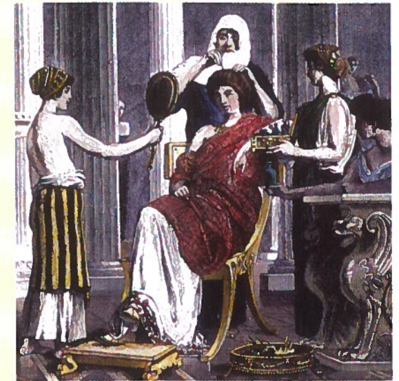
Many wealthy Romans, such as this woman, were attended by personal servants and slaves.

Country Life Ninety percent of the empire's people lived in the country. The wealthy often owned villas. Farms provided much of the food for the cities. Slaves did much of the farm work. Many country people were not slaves, but their lives were hard. They lived in huts and worked their own small farms or on the great estates.