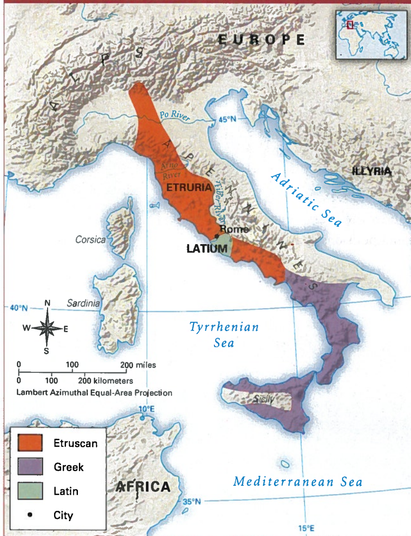
Italian Peninsula, 6th Century B.C.E.

cuniculus an underground irrigation system invented by the Etruscans