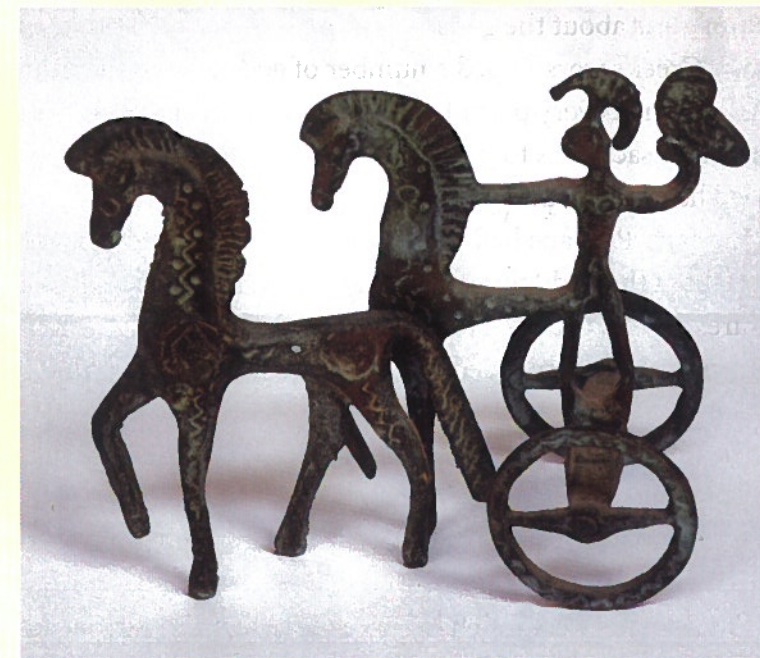
The Etruscans developed the sport of chariot racing, which the Romans later adapted.

The Influence of Greek Art and Religion The Romans greatly admired Greek art. The blend of Greek and Roman styles became known as "Greco-Roman" art. The Romans also made many Greek gods and goddesses their own, although they were more interested in rituals than in stories.