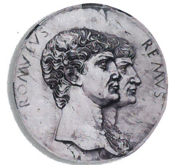
The twins Romulus and Remus, shown on this ancient coin, are the legendary founders of Rome.

The tale of Romulus and Remus is a colorful myth. In this chapter, you will learn about the real founding of Rome. You will also learn how two important groups, the Etruscans and the Greeks, influenced the development of Roman culture.