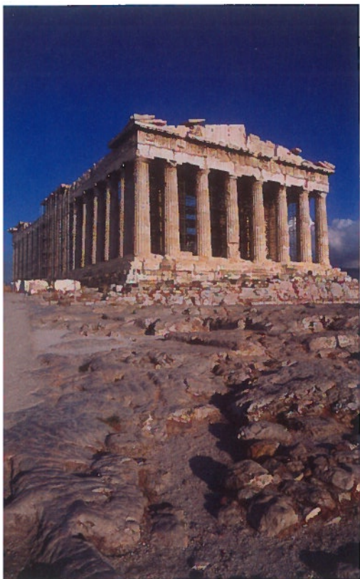
In the ruins of the Parthenon from ancient Greece, we can see the architectural details that influenced building designs in Rome and, later, around the world.

Greeks and Romans wrote in all capital letters. This example of Greek writing is inscribed on a voting token called an ostrakon .