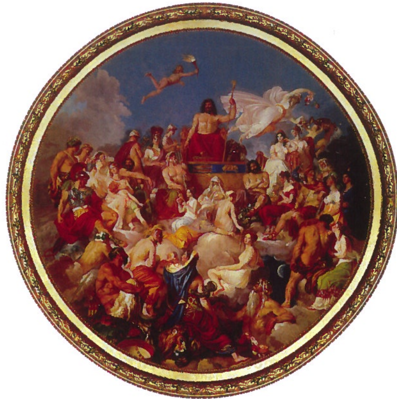
The Greek gods and goddesses of Mount Olympus, shown in this painting, were adapted into Roman religion.