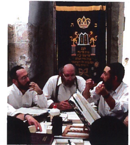
In the tradition of Rabbi ben Zaccai's first school, scholars today continue to learn and to share their understanding in Torah study groups like this one.

In 1948, a new Jewish state, Israel, was created in part of the lands once ruled by David and Solomon. Jews from many places settled in their ancient homeland. For other Jews around the world, Jewish traditions have enabled their religion to thrive.