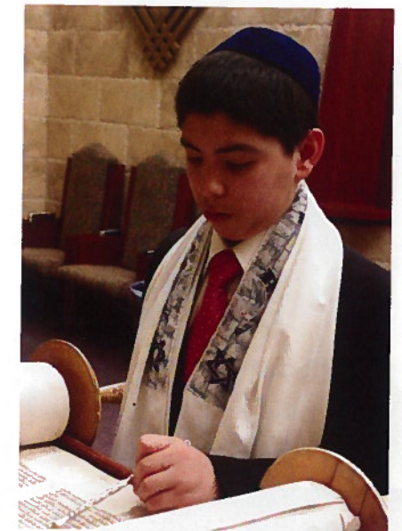
This boy reads from the Torah during his bar mitzvah, a coming of age ceremony for Jewish children.

◀ A detail of a historic synagogue in Prague, in the Czech Republic